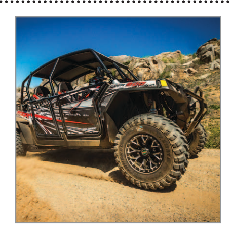
The Mongrel is optimized for a variety of terrain, including dirt, mixed terrain, rocks and paved surfaces.