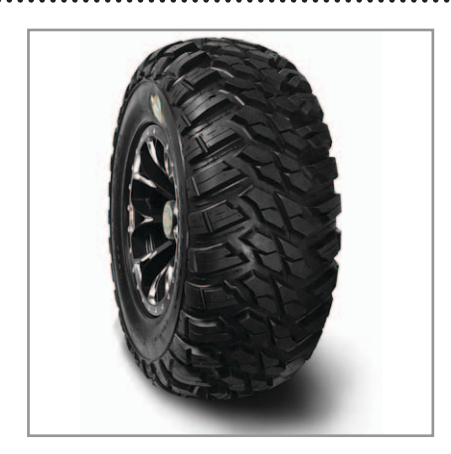
The Mongrel is the first true multipurpose tire designed specifically for SxS UTVs and Utility ATVs.

About GBC Motorsports: GBC Motorsports has been building ATV tires for over 30 years. Manufactured under the Greenball name initially, in 1995, GBC Motorsports was formed to focus on bringing to the ATV and Powersports market performance tires for every riding style. GBC Motorsport's passion is to provide the highest quality, best value, and most innovative performance tires to the Powersports enthusiast.