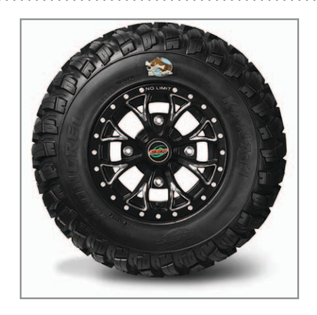
This 8-ply DOT approved radial features an 87 mph speed rating.